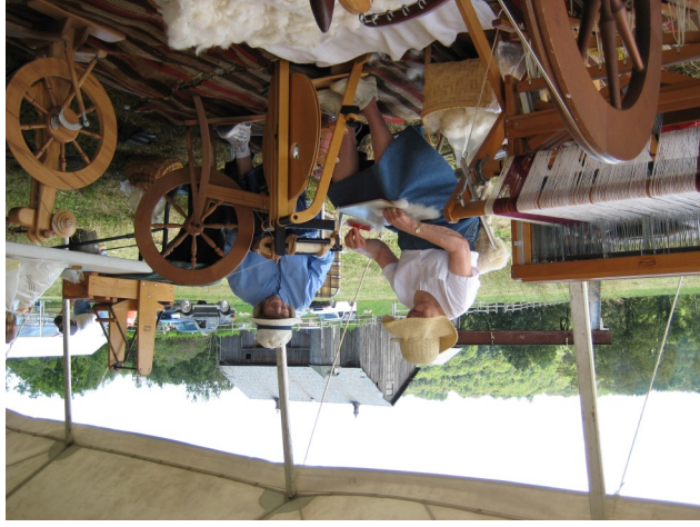
The guild demonstrating at a civil war reenactment