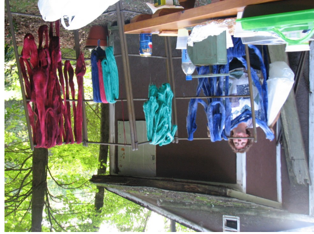
A Guild Dye Day